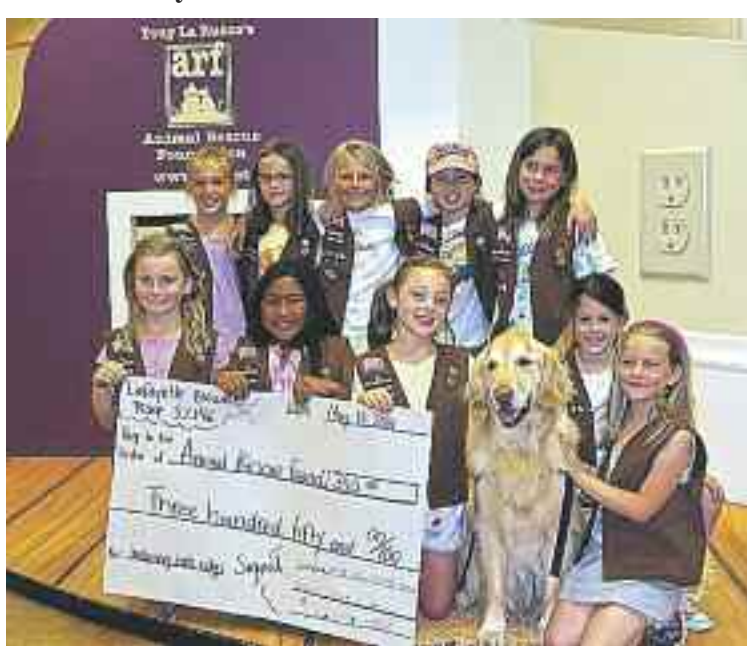
Lafayette Brownie Troop 32146 recently presented a check from cookie proceeds donated to ARF.